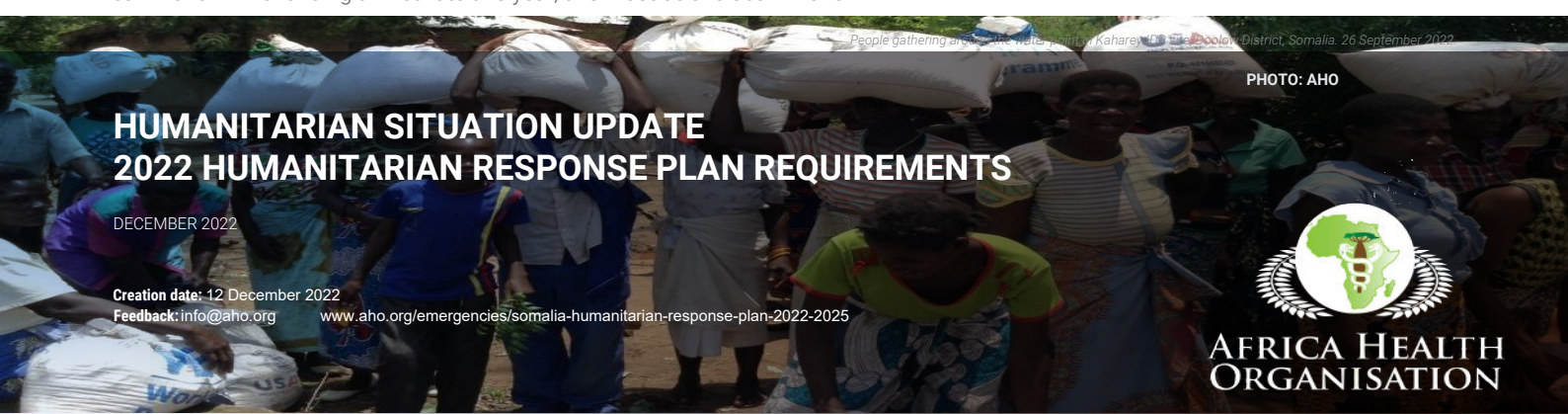
People gathering around the water point in Kaharey (D) State, Balcad District, Somalia. 26 September 2022

As humanitarian partners focus on saving lives and averting famine, there is a critical need to invest in livelihoods, resilience, infrastructure development, climate adaptation and durable solutions - to counter the longer impact of climate change. With the worsening situation, an urgent infusion of additional funds is needed to respond to the most critical needs and mitigate the impending loss of life across Somalia in the months ahead. One of the most valuable lessons learned during the 2016/2017 drought response was the difference that timely funding can make. While funding arrived late this year, this must be avoided in 2023.